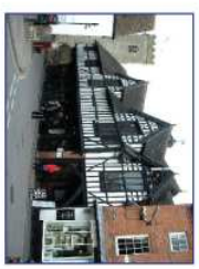
Guildhall 'Shropshire Tile Exhibition'*